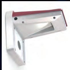
Illumination for night competition