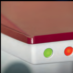
Sun and rain protection system