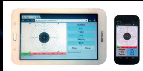
PreciShot software for PC, tablet and smartphone